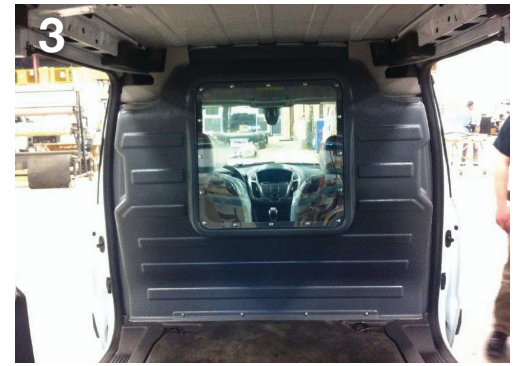
Slide the partition into place so that it lines up against the B-Pillar and along the headliner.