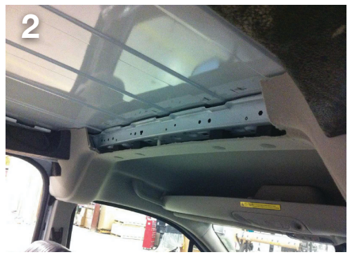
Using a knife, trim the headliner along the lower trim line between the inside edges of the outermost ceiling ribs.