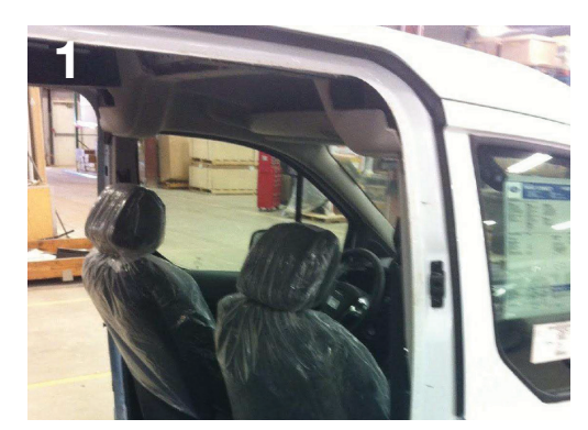
Pull back the rubber trim from around the sliding door frames.

DISCLAIMER: WHILE OUR PRODUCTS ARE PRODUCED WITHIN A MANUFACTURING PROTOCOL - ABS COMPOSITE PARTITIONS AND WALL LINERS COULD HAVE SLIGHT VARIANCES THAT OCCUR DURING THE MANUFACTURING PROCESS. VARIANCES IN THE VEHICLE MANUFACTURING PROCESS CAN ALSO AFFECT HOW OUR PRODUCTS FIT. IT MAY BE NECESSARY TO TRIM SOME AREAS TO ACCOMMODATE A BETTER FIT. SHOULD YOU HAVE QUESTIONS DURING THE INSTALLATION PROCESS, PLEASE CONTACT US.