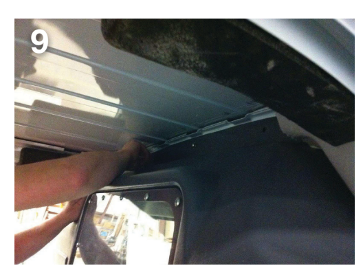
Loosely secure the floor and ceiling with the 1 ½" screws ( D ), washers ( C ), and split washers ( B ).