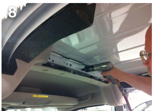
Install plus nuts (A) in the three holes in the ceiling pillar with the plus nut gun. Slide the partition into place, aligning the pre-drilled holes to the holes just drilled.