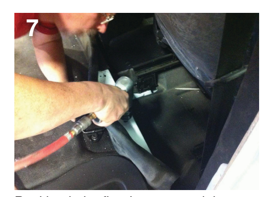
Peel back the flooring to reveal the metal underneath. Insert and secure plus nuts (A) using the plus nut gun for the four holes. Place the spacers (F) over the plus nuts before putting the flooring back in place.