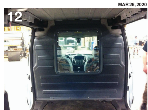
Installation is complete.