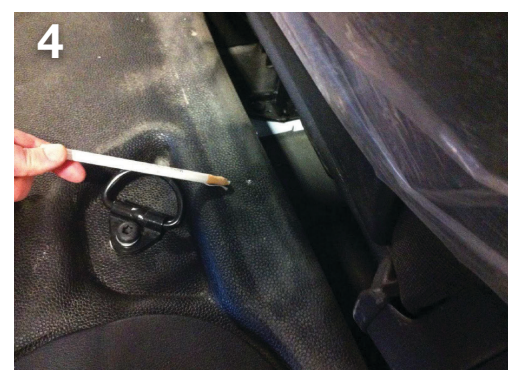
Using the four holes at the bottom of the partition as a guide, mark holes on the carpet.