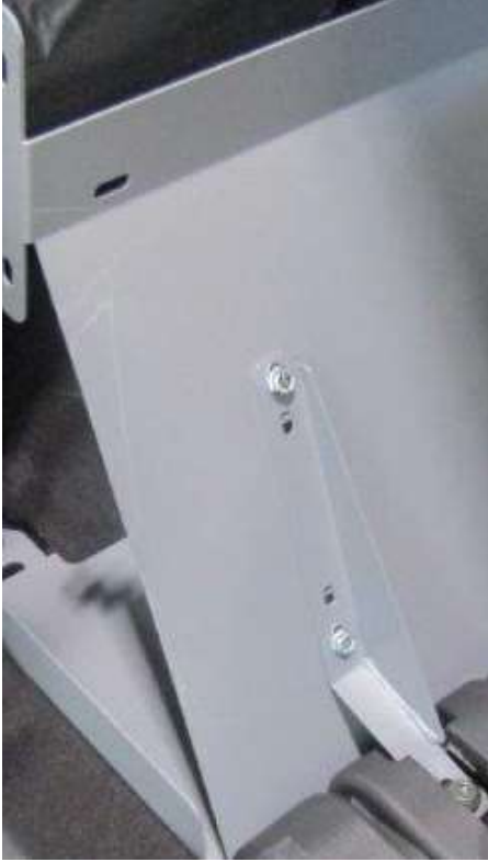
Figure 3: Attachment Bracket w/ Hardware