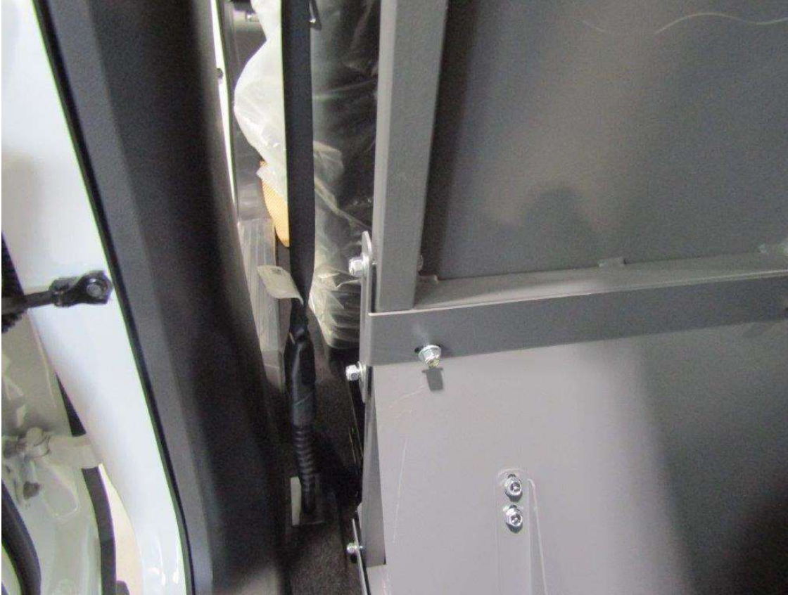
Figure 6: Partition Mounted to Bracket w/ Hardware