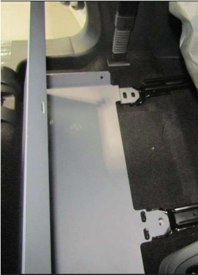
Figure 2: Front Tabs in Seat Slide