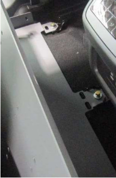
Figure 4: Replaced Seat Bolt