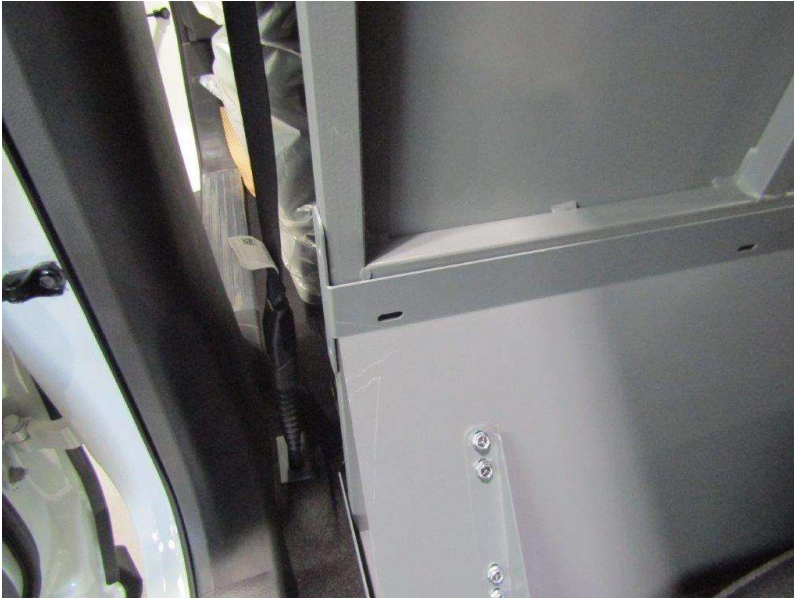
Figure 5: Partition Set Between Bracket Mounting Tabs